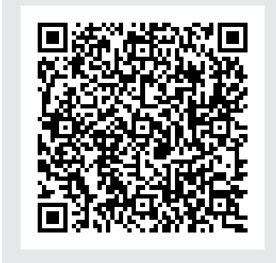
Scan the code above with your mobile device to go directly to the NB New York website for Great Live/Worl/Opportunity in Umbria $1,250,000.00